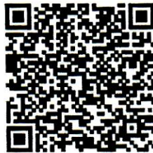
Justice Zone Components Checklist

https://docs.google.com/forms/d/e/1FAIpQLSe-mB4x9ZMt970wSErGwp4Zpyx6pkdNK6YRFT2CjsL7xnoTxw/viewform?usp=sharing